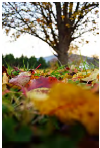
© Top: Boumen Japet / Shutterstock.com © Centre: Photonell_DD2017 / Shutterstock.com © Bottom: Tracy Burroughs Brown / Shutterstock.com