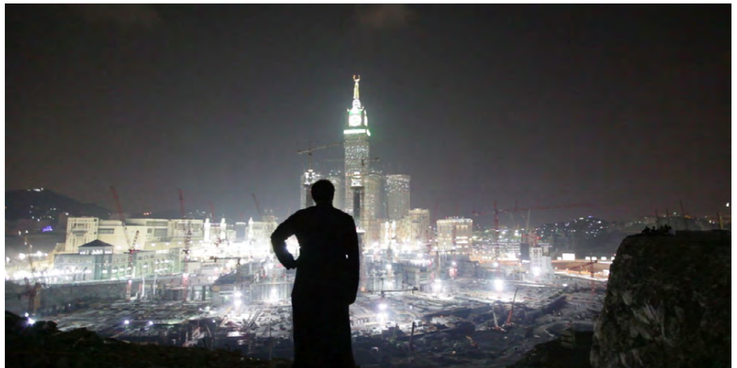
Borderland, From the Desert of Pharan series, 2011-2016